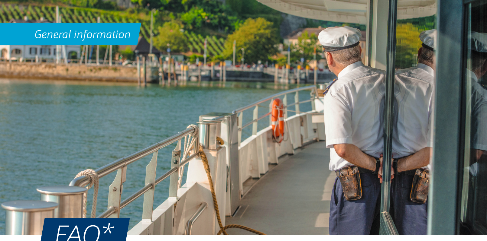
* for groups travelling on regular services (not applicable to scenic cruises or events).