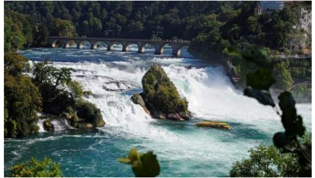
Rhine Fall Schaffhausen