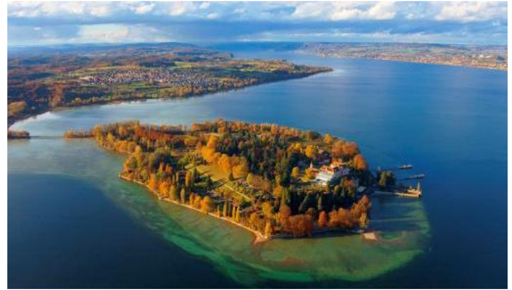
Island of Mainau