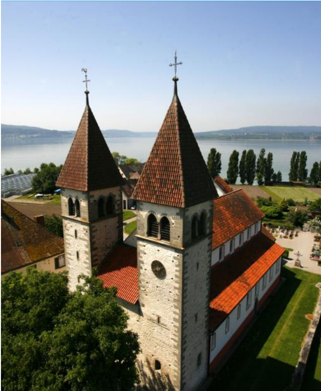
Island of Reichenau