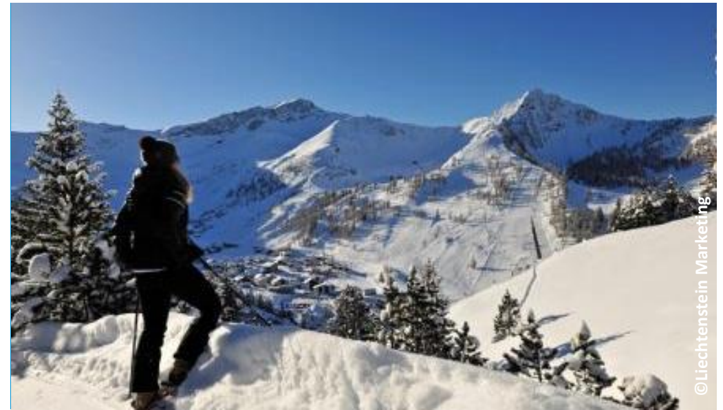
Skiing in winter