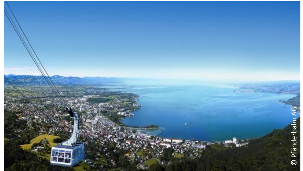
Pfänder Cable Car