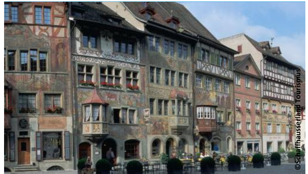
Stein am Rhein