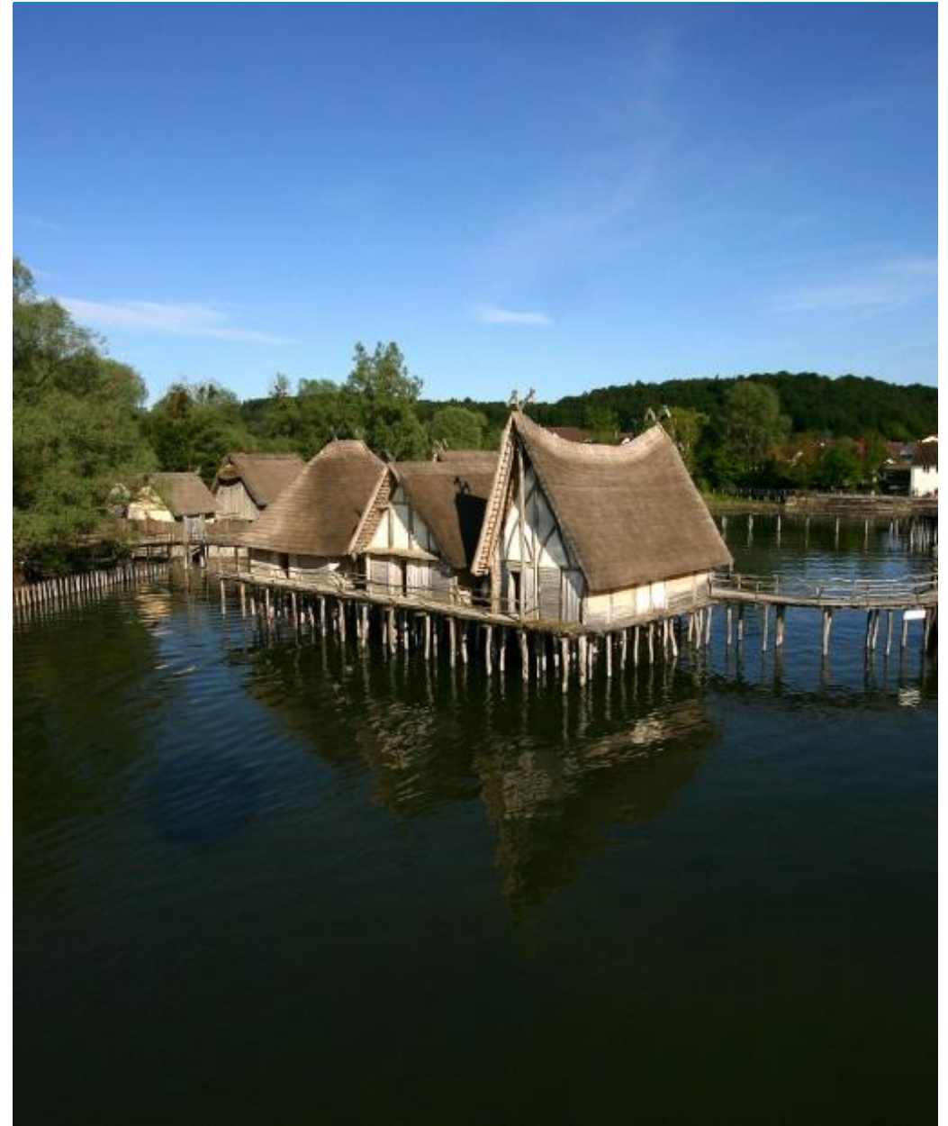
Lake Dwelling Museum Unteruhldingen