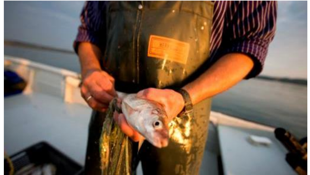
Freshly caught fish