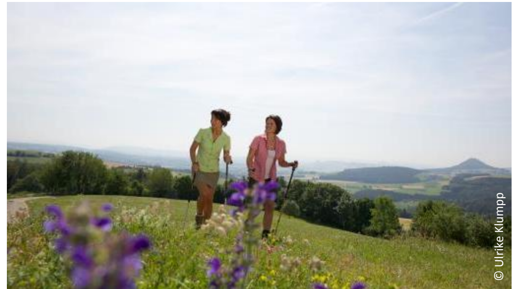
Premium hiking trails