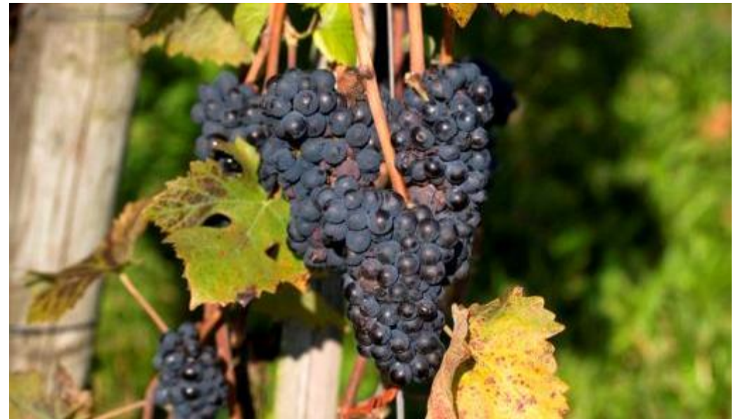
Grapes from Lake Constance