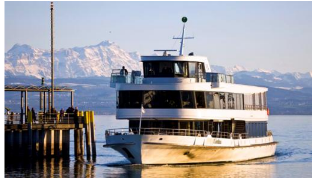
Lake Constance passenger ship