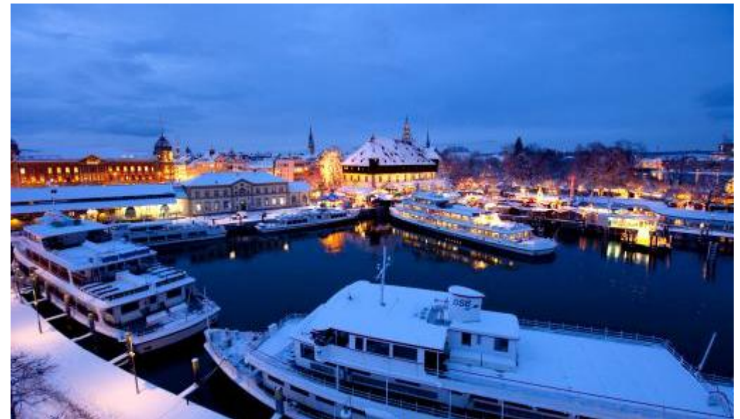
Christmas Market in Constance