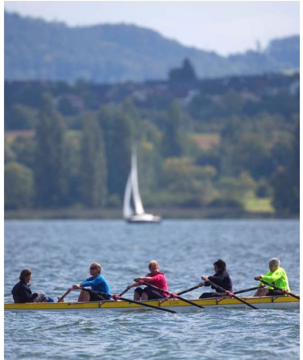
Rowing on Lake Constance

Lake Constance is no place for couch potatoes. Instead ride along the cycle paths around Lake Constance, paddle along the shore in a canoe or walk along well-maintained paths through the vineyards. For people who like to collect mountain-tops, there is no shortage of them around Lake Constance. Alternatively there is no better way to relax than floating gently along on an air bed or sliding down the slopes in winter.