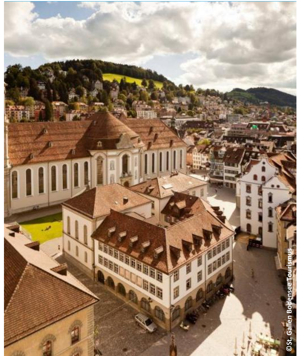
Convent of St. Gall