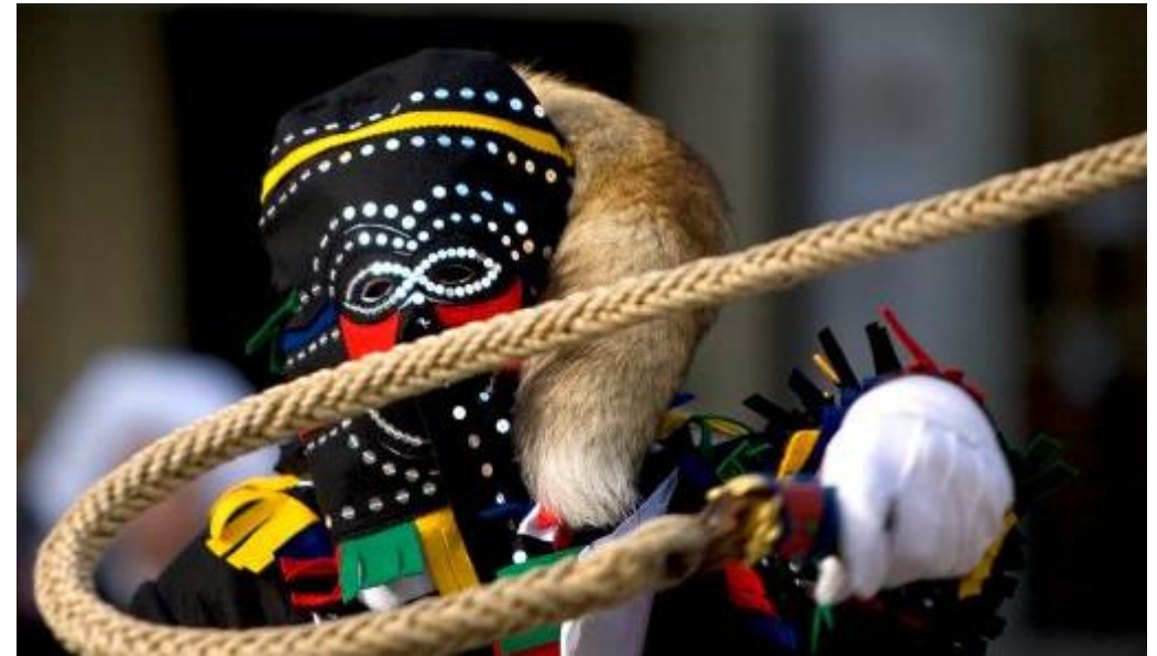
The fifth season at Lake Constance