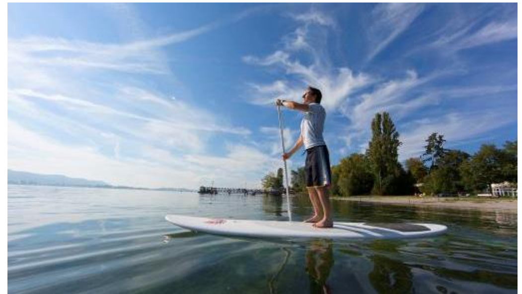
Stand-Up Paddling on the Lake